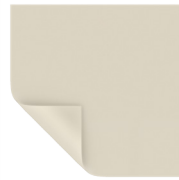
Dual Vision Half Angle: 65° Gain: 0.9