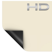
HD Progressive 1.1 Half Angle: 85° Gain: 1.1