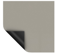
High Contrast Da-Mat Half Angle: 45° Gain: 0.8