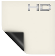
HD Progressive 0.9 Half Angle: 85° Gain: 0.9