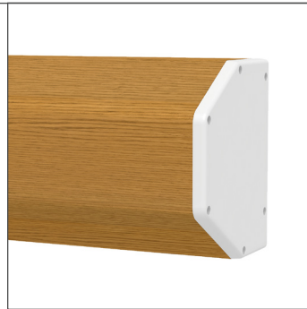
Light Veneer Case