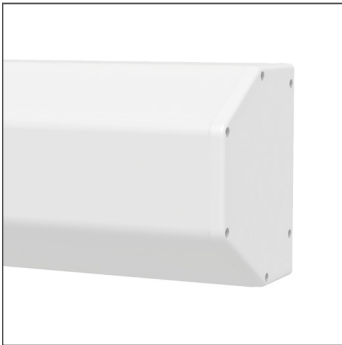
White Case (Standard)