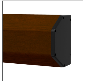
Dark Veneer Case