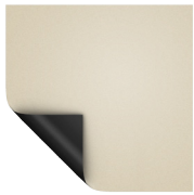
Cinema Vision Half Angle: 45° Gain: 1.3