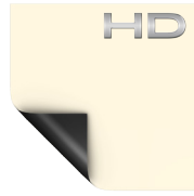
HD Progressive 1.3 Half Angle: 75° Gain: 1.3