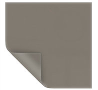
Da-Tex Half Angle: 30° Gain: 1.3