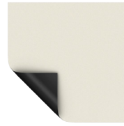
Da-Mat Half Angle: 60° Gain: 1.0