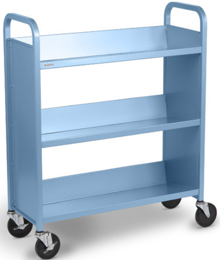
Double-sided Booktrucks shown in Topaz (TZ)

Bretfords trusted booktruck line features durability, safety, and value. A great fit for any classroom, library or office environment.