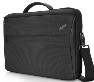
ThinkPad 14-inch Professional Slim Topload