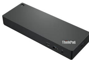
ThinkPad Universal Thunderbolt™ 4 Dock