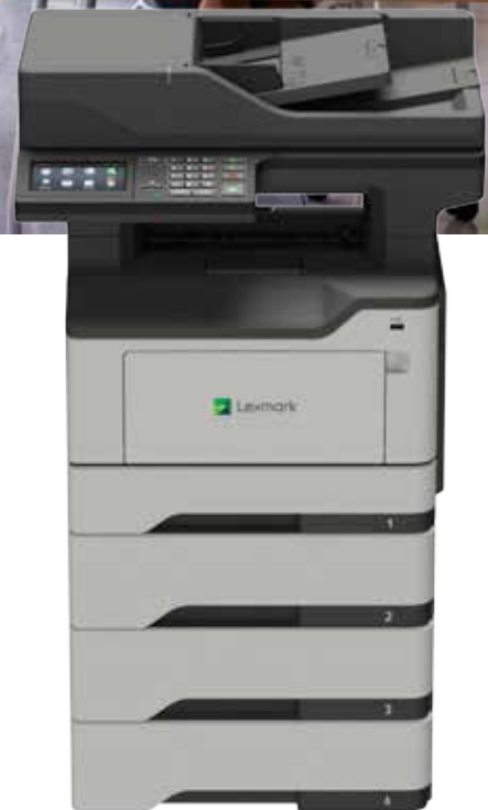
MX522adhe with optional trays