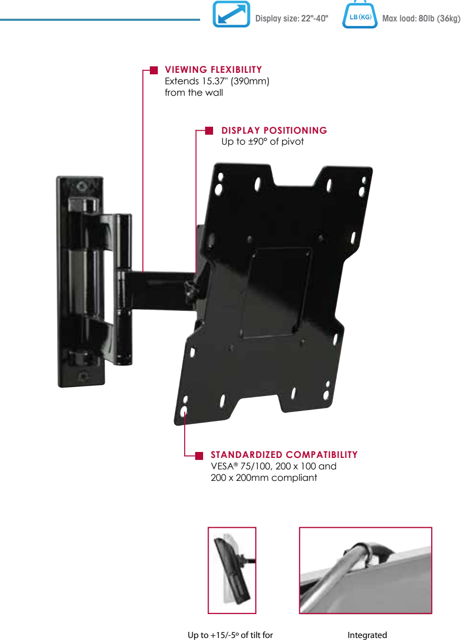
Up to +15/-5° of tilt for the best viewing angle

It's easy to get the best viewing options by pulling out the display from the wall, positioning it in almost any direction, even turning it around corners and then smoothly returning it to the wall when finished. With integrated cable management, cords and cables are never in the way - even when extending and retracting the display.