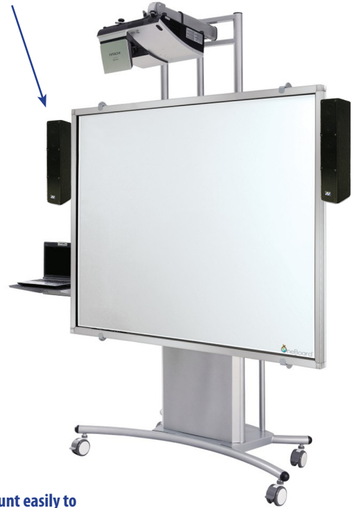
Speakers mount easily to a whiteboard or cart.