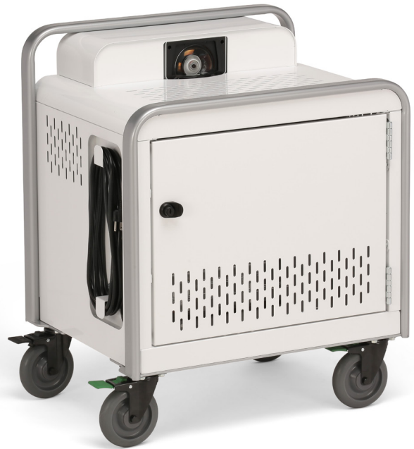
ProVision Projector Cart™ shown in Arctic White (AC)

Transform your learning space with the versatile ProVision Projector Cart™. Customizable for educational settings, it effortlessly creates dynamic displays, optimizing screen size with Epson® PowerLite 800F ultra short-throw technology for clear images up to 130"(16:9). Add audio for immersive learning and presentations.