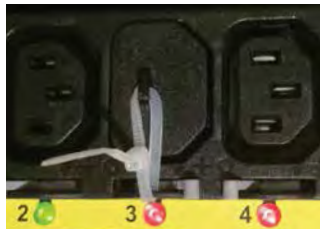
Cap secures in place with cable tie