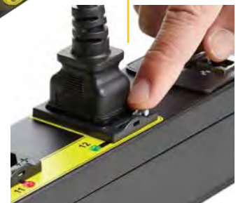
O is unlocked, + is grip engaged