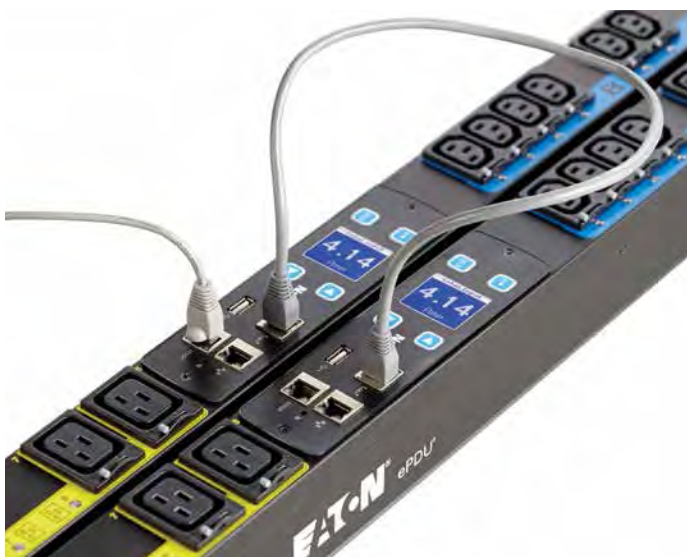
A and B power PDU sharing a network connection via daisy chain

Eaton's new patented daisy-chain capability allows up to eight ePDUs to share the same network connection and IP address. Unlike competitive rack PDUs that require a dedicated IP address for best performance, Eaton technology provides a 87.5 percent reduction in network infrastructure costs.