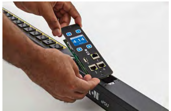
Module being removed without removing power to the ePDU

Eaton's new hot-swap eNMC (ePDU Network Management and Control) module can be replaced without the need to power down your rack. Increase uptime while enhancing serviceability and saving on unnecessary service calls. The menu-driven pixel display allows for easy setup and troubleshooting.