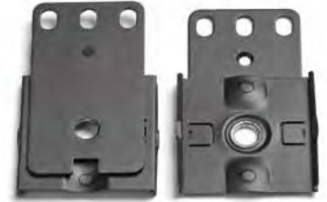
Eaton patented clip feet