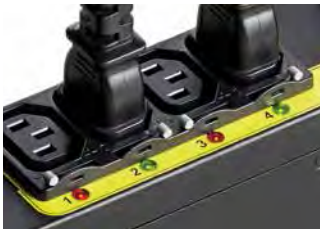
Green LED signifies power on and red is power off to outlet

Secure and protect your environment by easily turning off unused outlets. Avoid overloading your system from others plugging in unauthorized devices. Also consider closing access with an outlet cap.