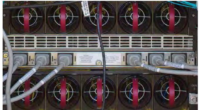
Typical server with multiple power inputs powered by two ePDUs

When connecting multiple source input servers to an A and B feed power source, the daisy-chain capability allows you to group power supplies across the ePDU. As a result, all the power supplies are controlled with a single action, which saves time rebooting servers with two to six power supplies.