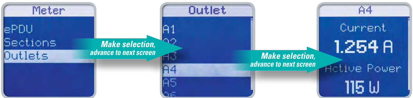
From meter screen, select outlets...