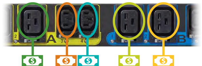
Each outlet can be billed separately.

Metering at the outlet level provides customer-level energy tracking and turns power billing into a revenue stream that considers actual usage. Similarly, you can measure power usage per application and assign it to specific departments for budgeting purposes or to justify costs.