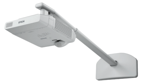
Projector shown with mount/rear cover kit (sold separately).