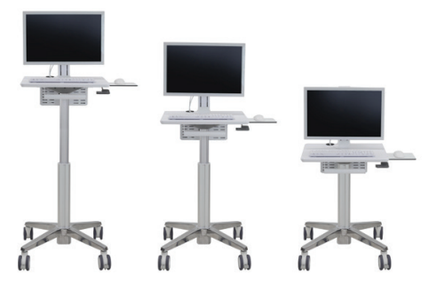
The height-adjustable column moves 16" (40,6 cm) so you work comfortably sitting or standing

© 2017 Ergotron, Inc. rev. 10/03/2017-EA Literature made in the U.S.A. Ergotron devices are not intended to cure, treat, mitigate or prevent any disease. StyleView is a registered trademark of Ergotron in the U.S.A. and China. Content is subject to change without notification