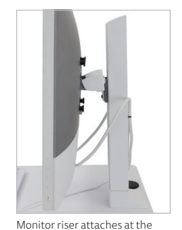
back of the worksurface