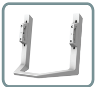
RECOMMENDED ACCESSORY: LX DUAL DIRECT HANDLE KIT 98-037-062 WHITE 98-037-224 MATTE BLACK