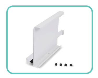
SV10 TABLET CONVERSION KIT, EASEL 98-003