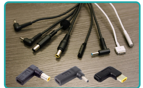
Emulator Adapter Cables

The Elevate Max USB-C Charging Cart is the pinnacle of efficiency for charging, securing, and transporting large sets of up to 36 devices. Powered by Quick-Sense USB-C PD, there is no need to plug in and arrange messy AC adapters. Plug devices into the included connectors and enjoy quick and efficient charging. The cart's slender footprint, double doors, and swivel casters make devices easily accessible—even in small spaces. The high-capacity Elevate Max USB-C Charging Cart has larger device bays to suit a broader range of device sizes, up to 17-inch screen size.