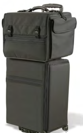
Piggy Back Strap for use with Rolling Luggage or JEL-1810W