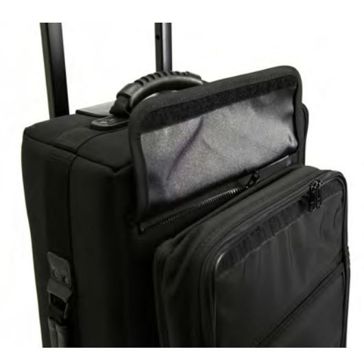
Easy zip on/off laptop computer case