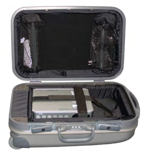
Interior of JEL-701PL Shown