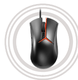
Lenovo Y Gaming Optical Mouse