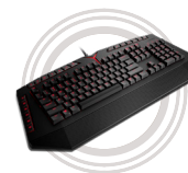
Lenovo Y Gaming Mechanical Switch Keyboard