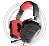
Lenovo Y Gaming Stereo Headset

* Example of Lenovo Legion catalogue naming convention