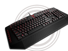
Lenovo Y Gaming Mechanical Switch Keyboard