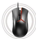
Lenovo Y Gaming Optical Mouse