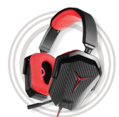
Lenovo Y Gaming Stereo Headset

* Example of Lenovo Legion catalogue naming convention