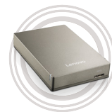
Lenovo UHD F309 USB 3.0 2 TB

* Example of Lenovo IdeaCentre catalogue naming convention