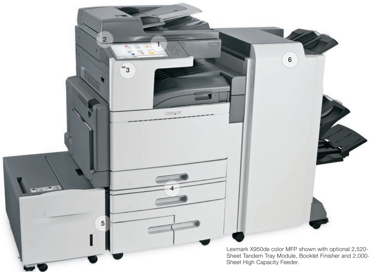
Lexmark X950de color MFP shown with optional 2,520-Sheet Tandem Tray Module, Booklet Finisher and 2,000-Sheet High Capacity Feeder.