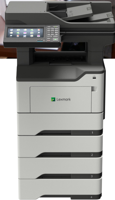
MX622adhe with optional trays