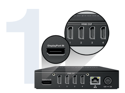
Connect using DP 1.2 input and 4 HDMI outputs