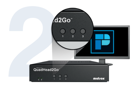
Configure using on-device buttons or the Matrox PowerWall software