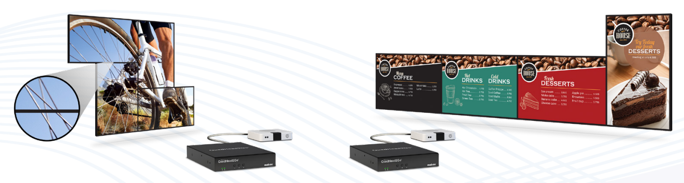
Fine-tune bezels for seamless image displays