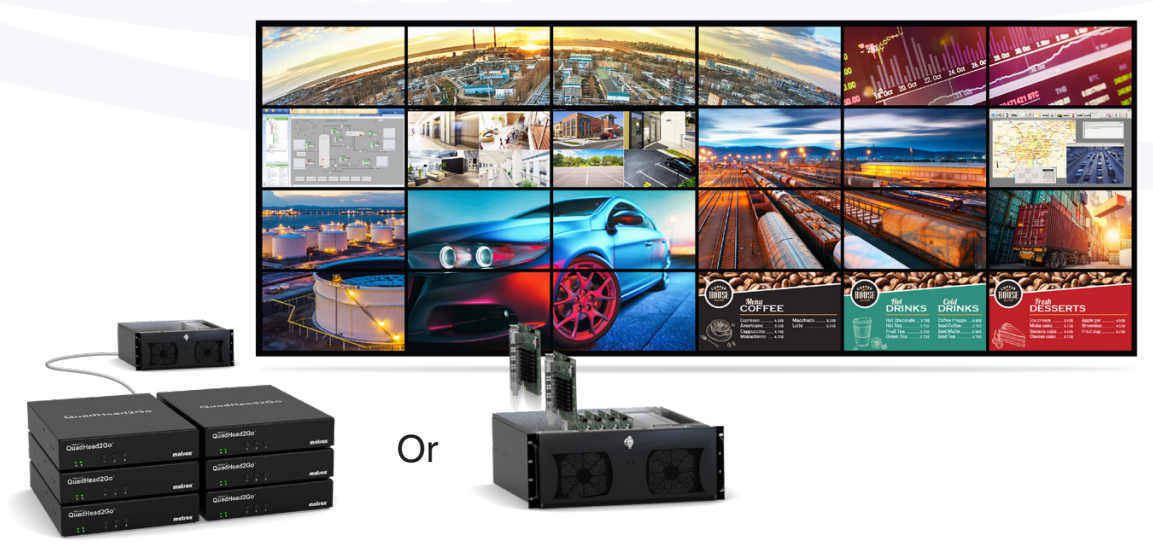
Use multiple QuadHead2Go units (appliances or cards) to easily create and/or expand large-scale video wall solutions