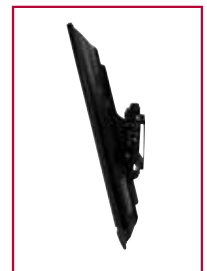
Tilt adjustment of +15/-5°