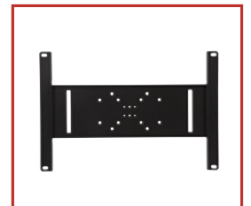
Dedicated Adaptor Plates. PLP-V models, sold separately