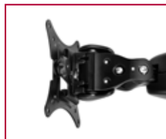
Quick release mechanism