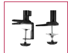
Desk clamp and grommet mount option