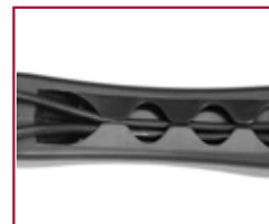
Internal cable management