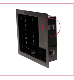
Stud locating tabs