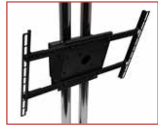
Shown with optional MOD-FPMS2