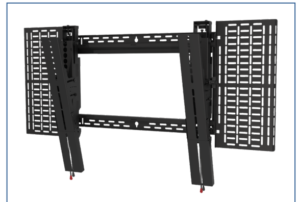
(2) ACC-UCM Universal Component Mounts shown with the SmartMount® Universal Scissor Wall Mount (STS650)

Easily attaches to the left or right side of the SmartMount® Universal Scissor Mount (STS650)