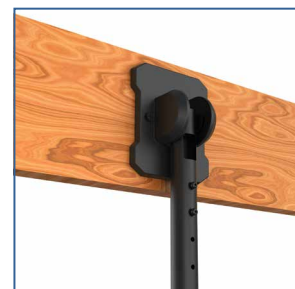
Mounts directly to wall structure when ceilings are too high