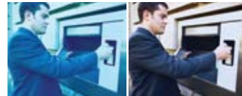
Color Optimizer: shows natural hues