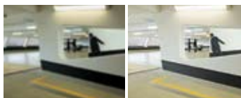
Detail Enhancer: sharpens the edges