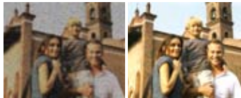
Motion Optimizer: Eliminates noise

SAMSUNG Electronics' digital signal processing engine enhances conventional broadcast signals and renders vivid images to improve the image quality when operating with composite video.