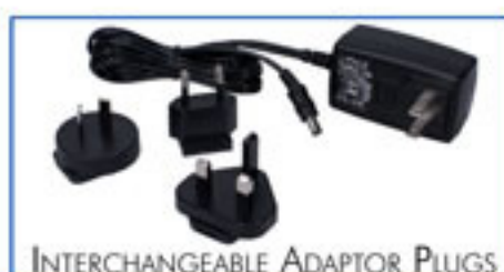
INTERCHANGEABLE ADAPTOR PLUGS