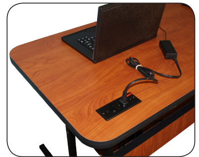
Shown: 60" x 25" Basic Workstation in Cherry (BAS60-CBB)