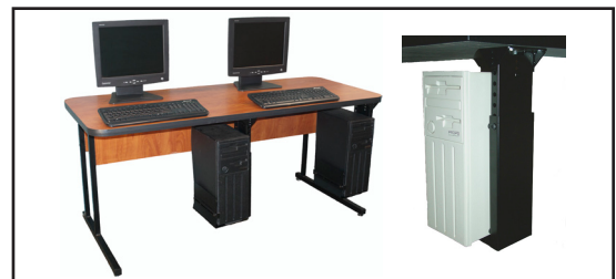
CPU holder(s) mounted in standard location (can also be mounted on ends - specify on order).