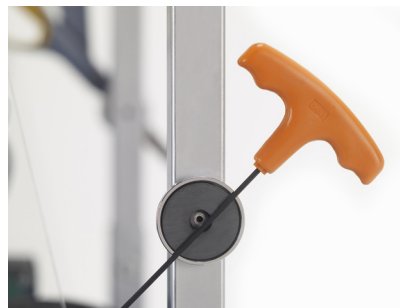
Magnetic tool holders