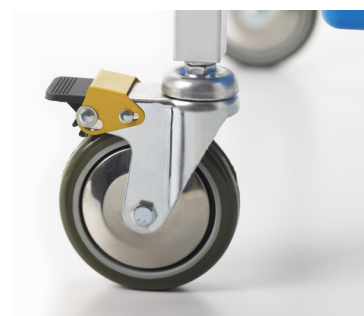
4" Casters, two locking