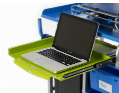
Sliding laptop tray