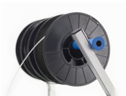
Adjustable Spool (holds 4 spools)