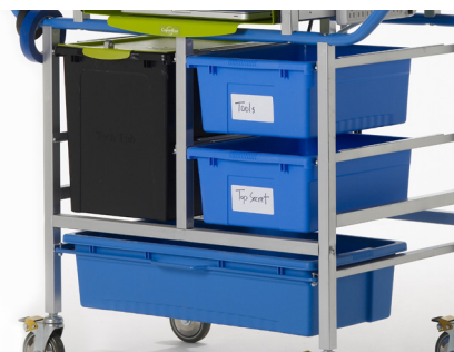
Compact storage - Open Tubs, a Really Big Tub and an optional Tech Tub™