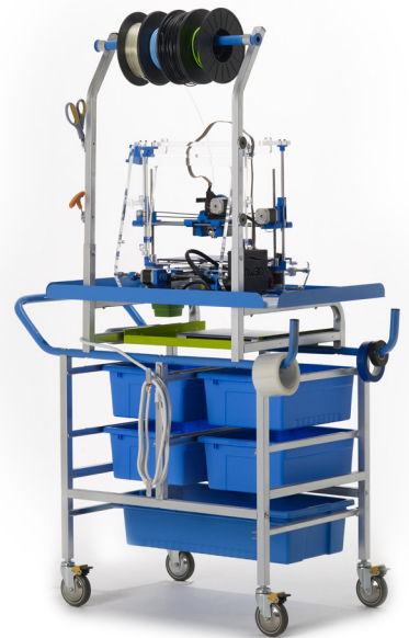
Base 3D Printer Cart (back view)