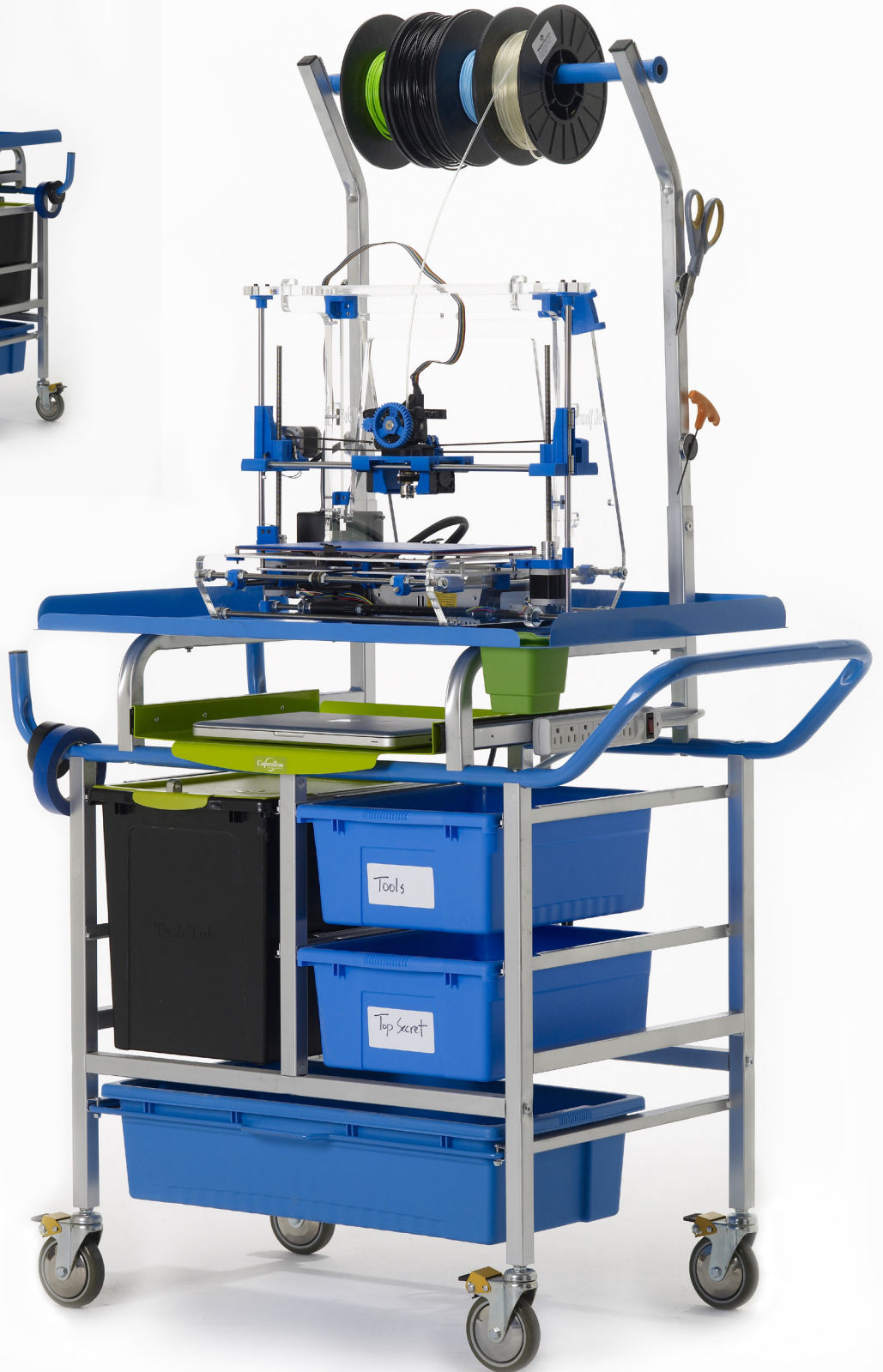
Premium 3D Printer Cart (front view)