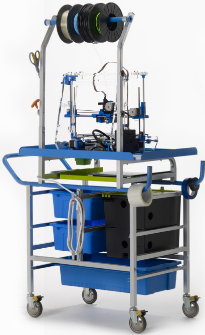
Premium 3D Printer Cart (back view)