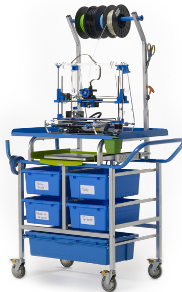
Base 3D Printer Cart (front view)